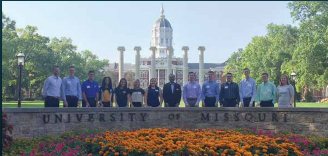
KPMG Data Analytics Students on the Quad

Mizzou School of Accountancy continues to flourish in 2018